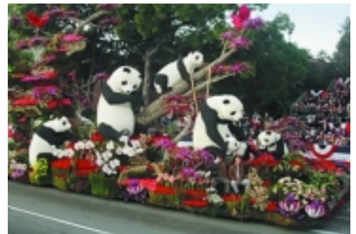
Rain Bird's "Playful Pandamonium" float

Rain Bird continued its proud tradition of bringing awareness to the importance of water conservation and environmental preservation through its 2005 Tournament of Roses Parade entry, Playful Pandamonium. Staged every year since 1890 in Pasadena, California, the Rose Parade has become a national institution. In accordance with this year's Parade theme 'Celebrate Family' Rain Bird's 2005 float entry celebrated a magnificent family of giant panda bears as they playfully frolic, catch up on their sleep and crunch on fresh bamboo culled from a mist-shrouded forest given life by an adjacent stream.