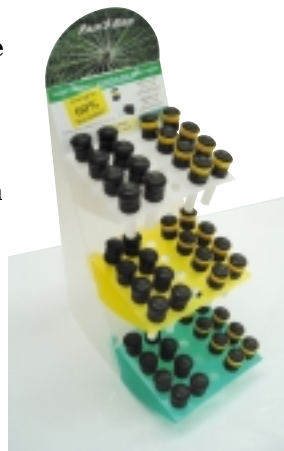
Rain Bird's Rotary Nozzles convenient counter display

Visit www.rainbird.com/rotary-nozzles for an online demo or speak to your Rain Bird Australia Sales Specialist for more info and look out for the new Rain Bird Rotary Nozzle counter display stand next time you visit your local Rain Bird reseller.