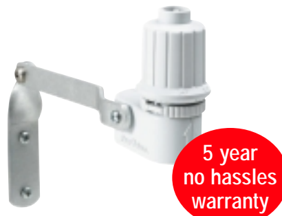
The Rain Bird Rain Sensor

This innovative sensor offers the flexibility of multiple rainfall settings of between 5 and 20 mm with just the twist of a dial and an adjustable vent ring to control drying time. It comes with a 7.6m length of UV-resistant extension cord for easy connection to all popular 24VAC irrigation controllers – and a 5-year 'no hassle' warranty.