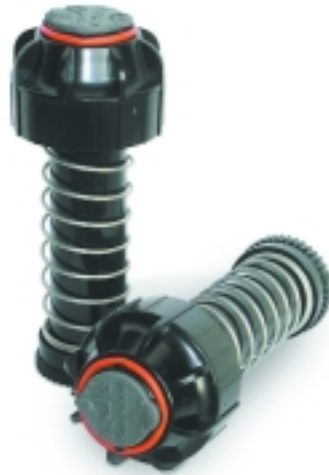
UPG 5004 Rotor

“Don't just change out a rotor, UPGrade it.”