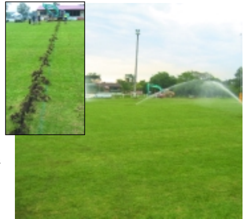
Singleton Oval, Hunter Valley

The installed system includes the use of Rain Bird model 8005 pop-up sprinklers with 'Rain Curtain' nozzles which emphasised the product's superior water use efficiency. Moreover, the 8005 has many built-in vandal resistant features. Visitors learned how the Rain Bird