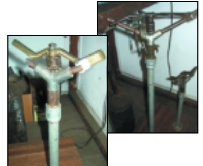
Some of the many early Rain Bird sprinkler prototypes.