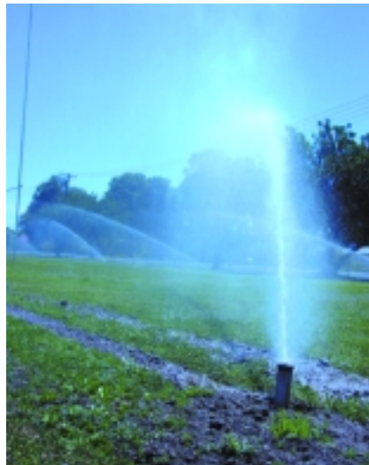
Rain Bird 7005 rotor at work in Bourke

screened water from the Darling River and controlled by Rain Bird Brass Body 80mm Series 300BPE solenoid valves and an ESP-6LX+ outdoor mount commercial controller. A robust package by any estimation!