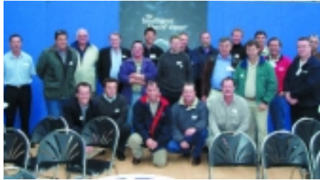
The Independent Water Group at the Rain Bird Australia presentation at the head office in Melbourne

The IWG (Independent Water Group) held their annual general meeting in Melbourne on July 22nd - 26th, 2004 to discuss group business and to tour some of the manufacturers that contribute to the IWG's many successes.