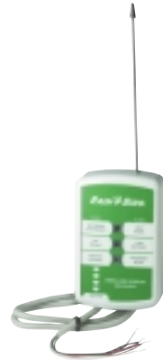
Wireless Rain Sensor

The new Rain Bird Wireless Rain Sensor was recently recognised as a ‘highly commended innovative New Product’ at the IAA Conference & Exhibition 2004.