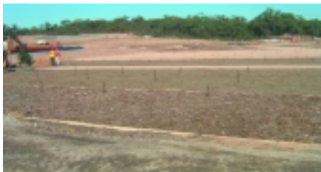
The Australia Gardens under construction

The earth works to re-shape the site had commenced several months earlier with many tonnes of soil being moved and specially coloured soil having been brought in from quarries around Melbourne.