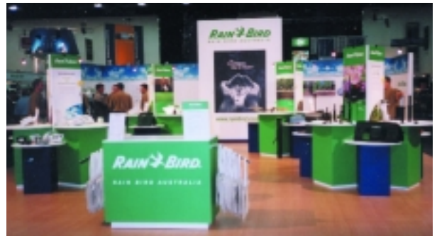
Rain Bird Australia's eye catching stand at the IAA Exhibition and Conference, Adelaide, May 2004.