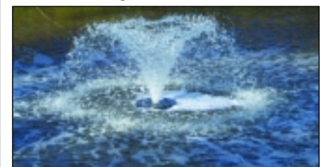
Otterbine Fountain/Aerator in action

the C.E.O. of Otterbine Barebo Inc., the opportunity to talk to both distributors and consultants about lake and pond water quality issues: what causes different water bodies to deteriorate and the different remedies to these problems. The extensive range of both fountains and aerators provide solutions for all type of water quality issues. For golf, municipality and residential developers, there are units that can be completely hidden or spectacular fountains for the aesthetically minded. Following on from Melbourne, Greg Smith together with Shaun Sprouster and Troy Barbour from Rain Bird Australia hosted field days in Sydney at the Coast Golf Club and at Parklands on the Gold Coast. With water becoming an even more precious resource, Rain Bird's involvement with Otterbine Barebo Inc. further enhances our commitment to "The Intelligent Use of Water™".