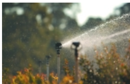
The Rain Bird LF1200 in action at Downes Nursery.

The system will be used in conjunction with Rain Bird LF1200 sprinklers which are designed for high uniformity so all container pots are evenly wetted.