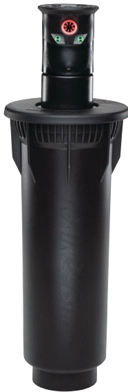
11000 Series Rotors

The Rain Bird 11000 Series Rotor is specifically designed for use on sports fields and large commercial turf applications. Providing excellent water distribution uniformity over a full 105' (32.0 m) radius, makes this rotor ideal for sports fields and reduces the number of heads required. With a small exposed head and included rubber cover, this rotor is designed for in-field use and therefore can irrigate fields 25% larger than 1" rotors with 40% fewer rotors.