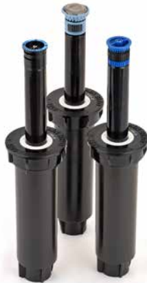
1804-SAM-PRS-45 Spray Heads

Superior irrigation technology is a top priority for this high-profile expo that puts Dubai in the global spotlight. All solutions need to be durable and efficient to perform well in Dubai's hot, dry location, where only treated sewage water is available for irrigation. Plus, watering must be managed from one secure control system that integrates with the expo's existing building management system.