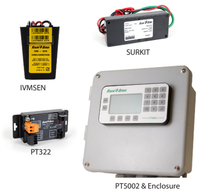
How to Specify