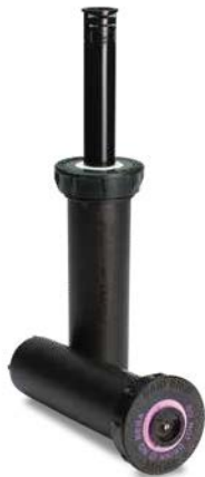
RD1800™ Series PRS Spray Head

Drought is an ongoing problem in the Metro Atlanta area, so the school district needs a cost-effective way to reduce its water usage. With standard water pressure of over 100 psi, schools are specifically concerned with misting and fogging caused by high flow rates. The right water-saving solution will operate efficiently at higher water pressure.