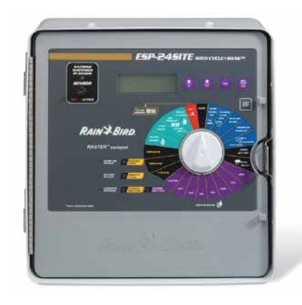
ESP-SITE-SAT Series Satellite Controller

Irrigating such a complex property requires a customized solution and a sophisticated central control system. All components must be durable enough to withstand reclaimed water from the resort's onsite water treatment facility. The new landscaping, which includes thousands of mature trees, needs sufficient water to take root in Beijing's somewhat dry climate. The grounds must appear pristine, as if they came straight out of a movie.