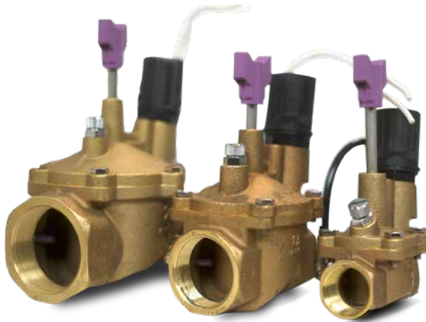
EFB-CP Series Valves

Electric remote control valves don't come any better than EFB-CP Series valves, which are reclaimed ready in order to handle the harsh conditions in non-potable water situations. Need a contamination-proof, self-flushing screen that cleans itself and resists debris build-up in dirty water? The EFB-CP's the one! Rain Bird brass valves offer long life and superior performance in high pressure applications.