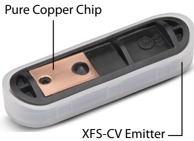
with Heavy Duty Check Valve