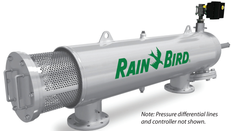
Note: Pressure differential lines and controller not shown.

Note: I-Series filters integrated with a Rain Bird Pump Station utilize 110 VAC solenoids.