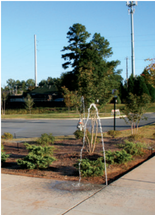
Spray without Flow-Shield Technology (nozzle removed)