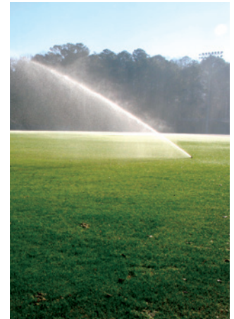
After installation of Falcon 6504 Rotor