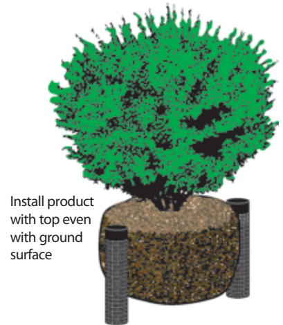
Install product with top even with ground surface