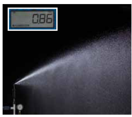
1800 Spray with PRS at 79 psi inlet pressure. PRS regulates flow to 0.86 gallons per minute.