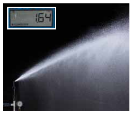
Non-PRS competitive spray at 79 psi inlet pressure. Without PRS, flow rises to 1.64 gallons per minute.