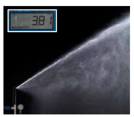
Non-PRS competitive rotor at 79 psi inlet pressure. Without PRS, flow rises to 3.81 gallons per minute.