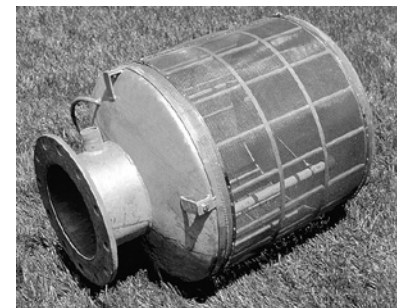
Rain Bird's Self-Cleaning Pump Suction Screen is built for years of trouble-free service

Contact Rain Bird for drawings or visit www.rainbird.com to download.