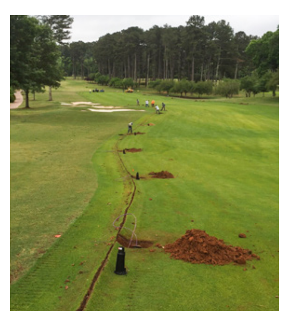
The irrigation system was updated in 2016, giving the club greater control and saving water and resources

valve from the pipeline. The existing satellite controllers were also now obsolete with the new system, so they were removed from the course.