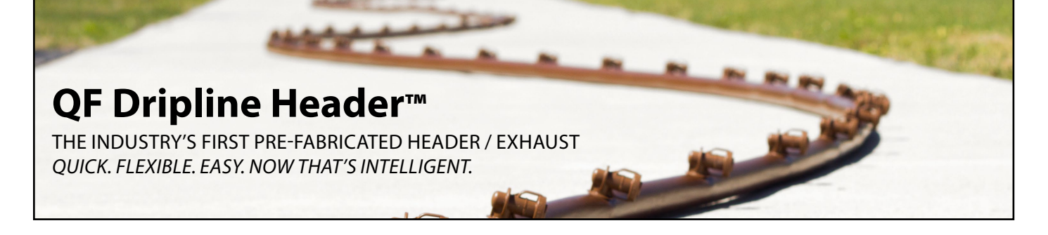
Twist Lock Fittings - 1000 Series (For use on 1"QF Header)

Rain Bird's Professional Customer Satisfaction Policy