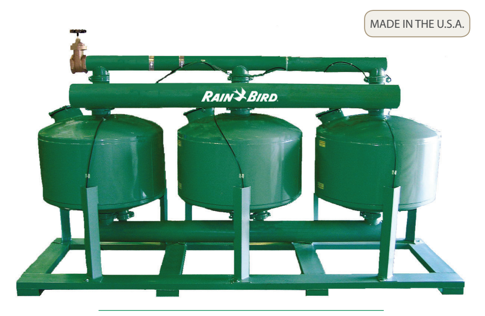
Rain Bird sand media filters will protect your irrigation system from solid contaminants including algae, sand and debris.

Automatic control makes Rain Bird your most costeffective choice for your next filtration system. Rain Bird automation packages allow fully unattended operation. All Rain Bird controllers monitor system operation on both pressure differential and elapsed time. Units are available in A/C power, D/C power or solar power for remote application.