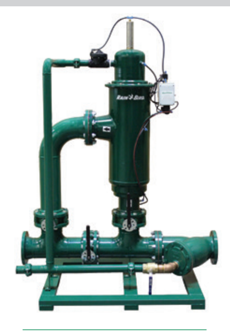
Economical design with integrated bypass assembly for fast and easy installation.

Note: "G-Series" filters integrated with a Rain Bird Pump Station utilize 115 VAC solenoids.