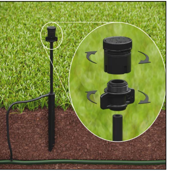
SQ Nozzle on Poly Flex Riser and Stake Assembly (PFR-RS)