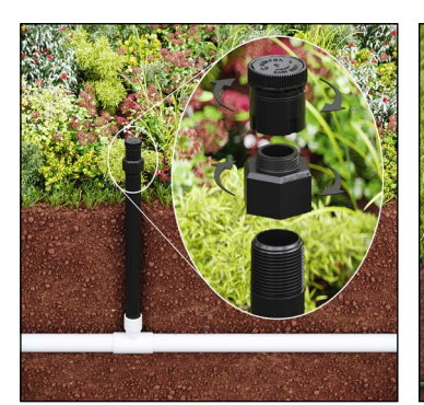
SQ Nozzle on Schedule 80 Riser Assembly