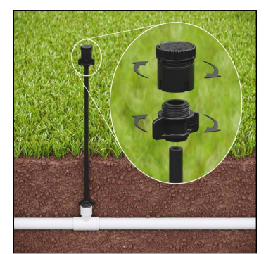
SQ Nozzle on PolyFlex Riser Assembly (PFR-FRA)