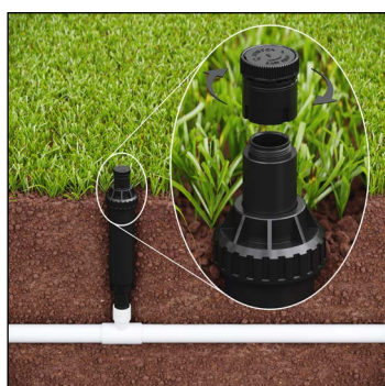
SQ Nozzle on 1800 Spray Body Assembly