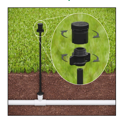
SQ Nozzle on PolyFlex Riser Assembly (PFR-FRA)