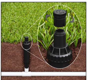
SQ Nozzle on 1800 Spray Body Assembly