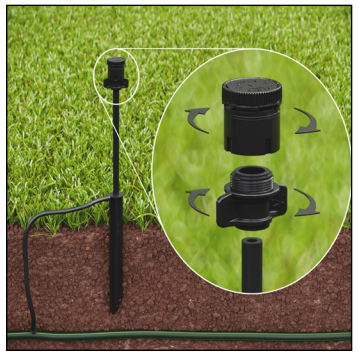
SQ Nozzle on Poly Flex Riser and Stake Assembly (PFR-RS)