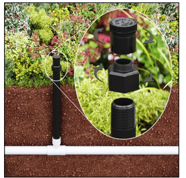
SQ Nozzle on Schedule 80 Riser Assembly