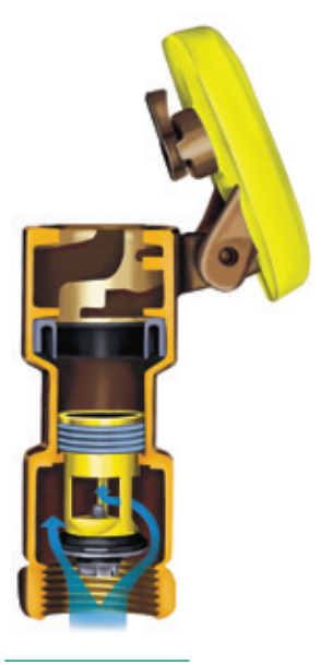
Quick-Coupling Valve Cutaway