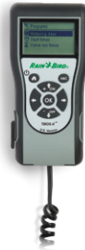
TBOS-II Field Transmitter