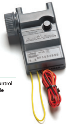
TBOS-II Control Module