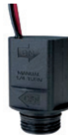
TBOS Potted Latching Solenoid