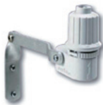
RSD-Bex Rain Shutoff Device