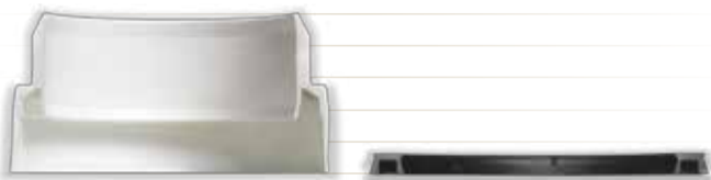
Hunter® Wiper Seal