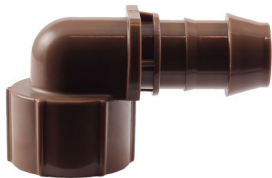
1/2" FPT x Elbow Fitting

1800 Series Spray Body Retrofit Assembly