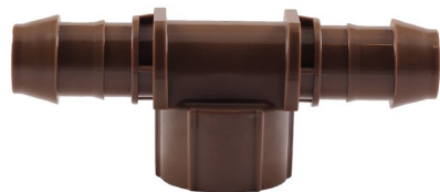
1/2" FPT x Tee Fitting