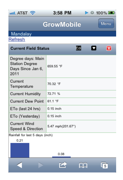
Get your data on a mobile device