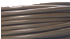
Ld 16mm 00-100