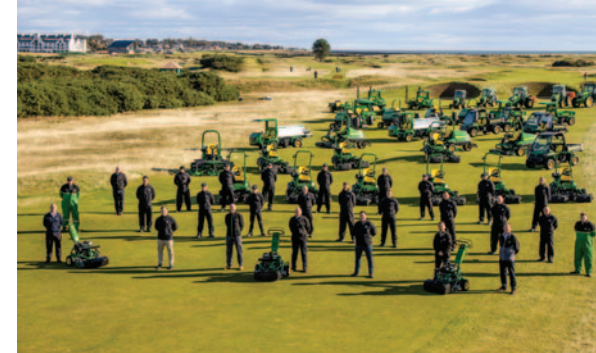
The team at Carnoustie with the John Deere fleet

It is a wonderful opportunity for all of our participants involved in our Women in Golf Programme and Girls Empowerment Academy as well as the 250 junior golf development programme participants (The Carnoustie Craws) to see the world's best women players up-close. Carnoustie continues to lead in the modernisation of the game of golf and has the added benefit that our courses are always in a championship-ready condition. I am sure that watching the top women in the world will inspire even more people of all ages and abilities to get involved, have fun and explore the health and wellbeing benefits of golf, especially at Carnoustie Golf Links.