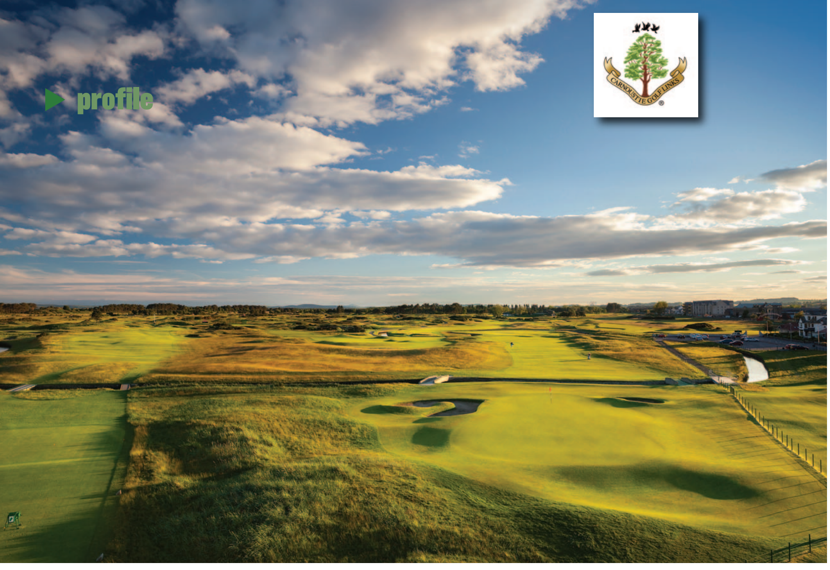
The Championship Course's 1st and 18th holes