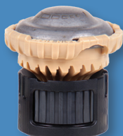
R-VAN18 (13' to 18')