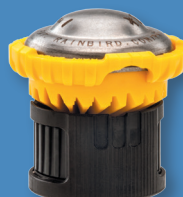
R-VAN1724 (17' to 24')