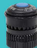
R1318F (13' to 18')