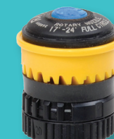
R1724F (17' to 24')