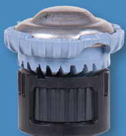
R-VAN14 (8' to 14')