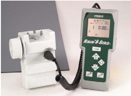
Cyclik control module and field transmitter connected via optical port.

The field transmitter is a hand-held unit with a keypad and is used by the irrigator to create the irrigation schedule. Once the schedule is keyed in, the transmitter is taken out to the field and the program is downloaded into the control module through an optical (infrared) link. After the program is in the control module, the valves open and close according to the schedule until a new program is created. Of the two programming options available—Cyclik Micro and Cyclik CI,—Quady is using the Micro option. They change the programs about every two weeks to match changes in weather patterns and vine growth strategy. “When this system was first built, nobody was concerned about adjusting the irrigation for the different soil types,” says Herb. “We tried to manage the irrigation by hand