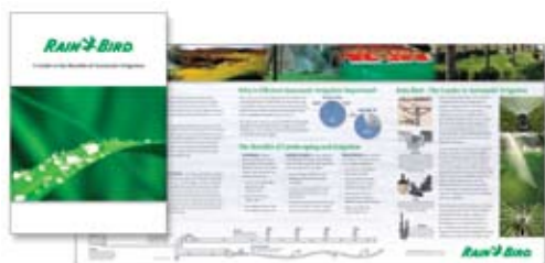
Benefits of Automatic Irrigation Brochure D37411

Enhance your professionalism by using these sales tools when presenting your services or recommending products to customers. A variety of materials are available to help educate customers about irrigation basics, benefits of an automatic sprinkler system, performance and quality of specific Rain Bird products, and more. To order, contact your local authorized distributor, or send an email request to RBInewsletter@RainBird.com