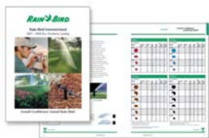
RBI Key Products Catalogue D39753