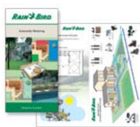
Automatic Watering Brochure (Design) D39738