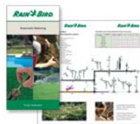
Automatic Watering Brochure (Realisation) D39739