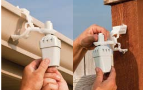
Versatile Mounting Bracket

The Rain Bird Rain or Rain / Freeze Sensor shall be manufactured by Rain Bird Corporation, Glendora, California.