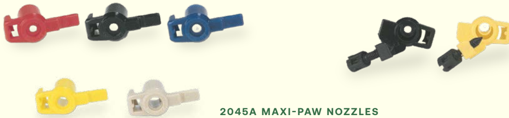
2045A MAXI-PAW NOZZLES

Performance data derived from tests that conform with ASAE Standards; ASAE S398.1.